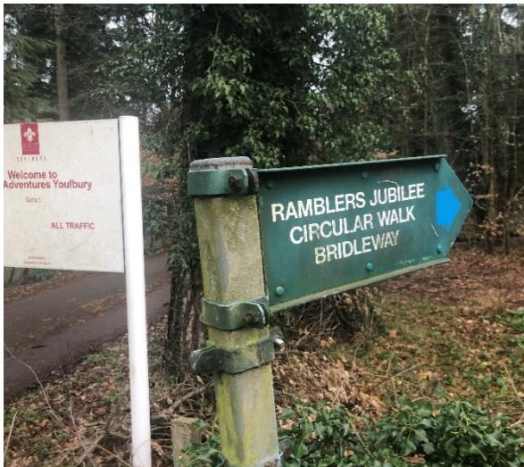
Sign at junction of Sandy lane and The Ridgeway 400m from the site