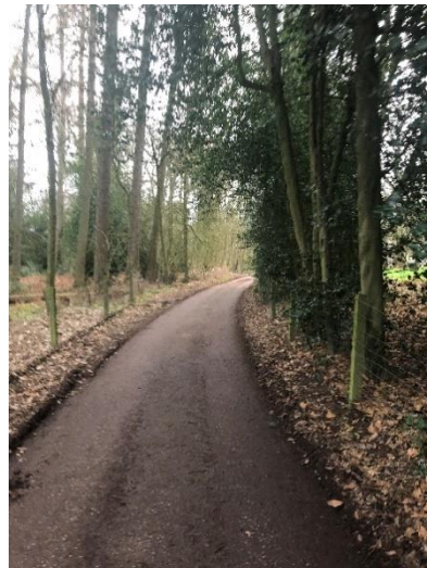
View along bridleway 415/17/20 to the site