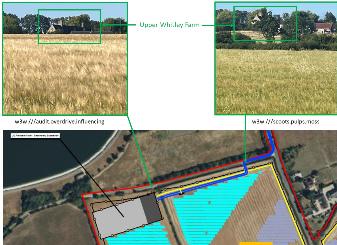
Figure 9.2 showing photos taken by CPC at 0800 on 08/07/2025 from the viewpoints shown on section of Figure 9.1, with Upper Whitley Farm clearly visible